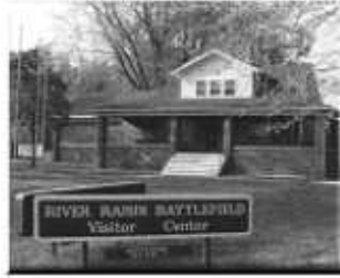
River Raisin Battlefield Visitor Center, 1403 East Elm Avenue