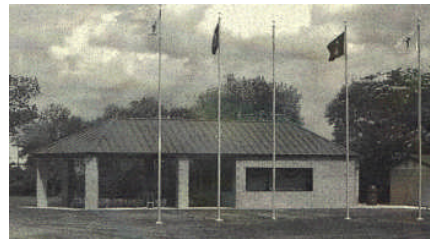
Monroe County Vietnam Veterans Historical Museum, Heck Park on North Dixie Highway

The center is located on part of the actual battlefield from the War of 1812, which is this museum's focus. Tours include a fiber-optic map presentation, clothing and uniforms, military life, life-size mannequins, and lots more. Tours last 1 1/2 hours. Free parking and admission. Watch for special events, such as annual January Memorial, and Battlefield Saturdays for children and families.